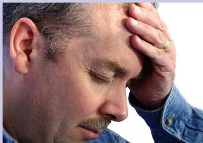
Headaches - Acupuncture may be an effective treatment option.

Please contact our office to have any of your questions answered.